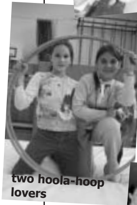
two hoola-hoop lovers