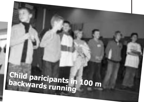
Child participants in 100 m backwards running