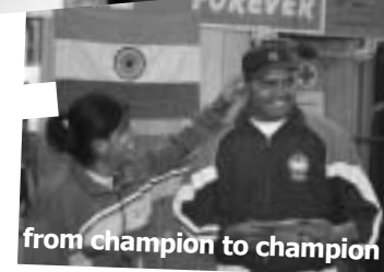
from champion to champion