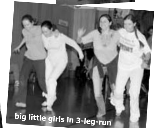
big little girls in 3-leg-run